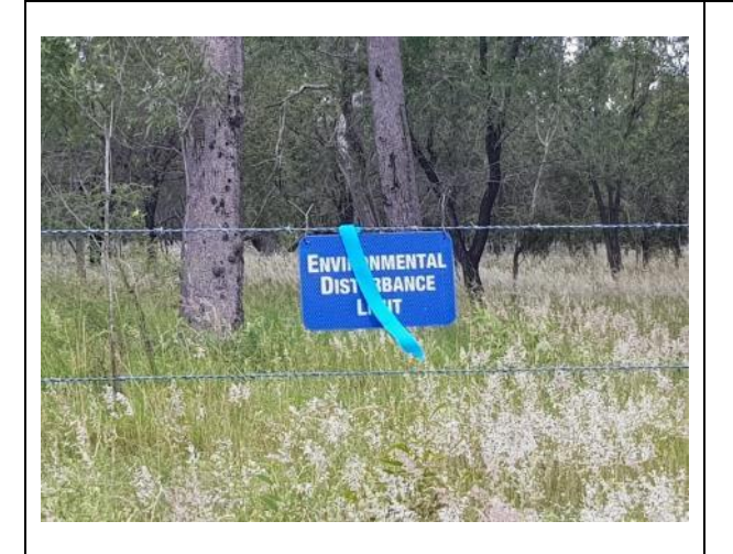
Approved clearing limit fencing and sign