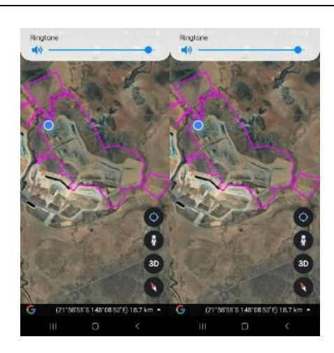
Field inspection route (a)