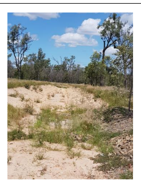
IPEE Eastern drain condition (sound)