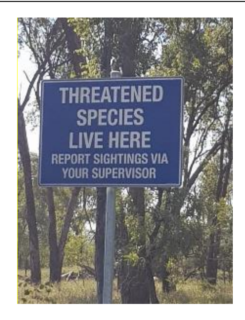
MNES Species Awareness Sign (photo from July 2021 site visit – remained in place Jan 2022 site visit)