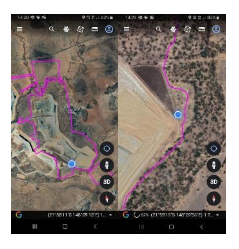
Field inspection route (c)