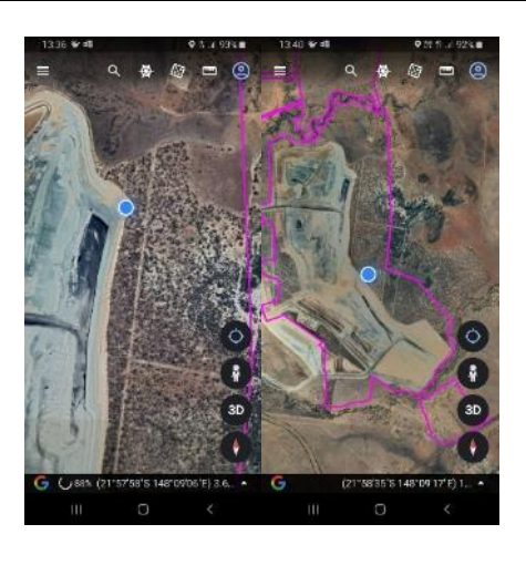
Field inspection route (b)