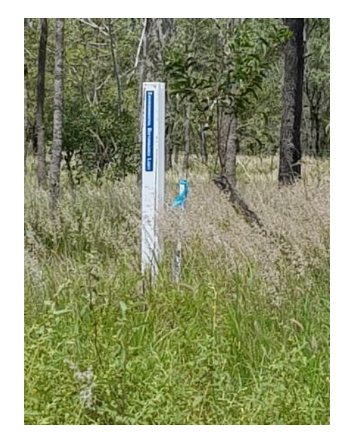
Approved clearing limit marker