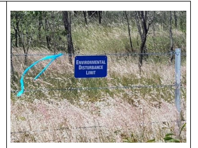
Fence condition and approved clearing limit fencing and sign