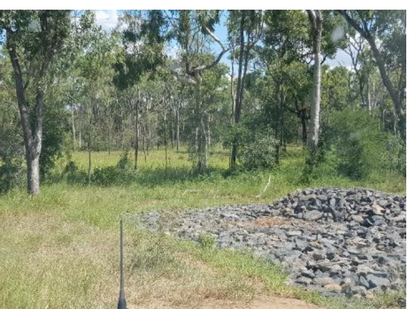
Drain condition and rock armouring IPEE southern sediment pond outlet