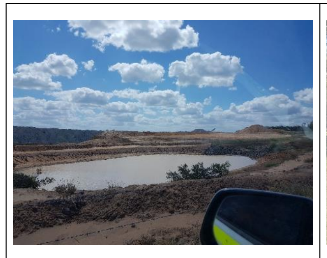
IPEE southern sediment pond and eastern drain condition and rock armouring at inlet