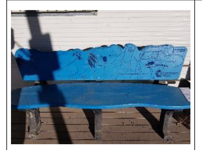
MNES Species Bench Seats (photo from July 2021 site visit – remained in place Jan 2022 site visit)