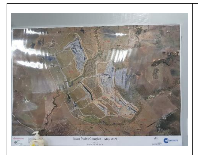
Aerial Photo for Planning Purposes (Environmental Office)